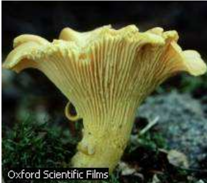
Oxford Scientific Films