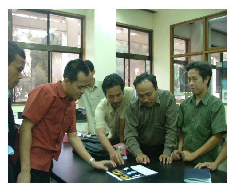
Kegiatan guru pada saat plan