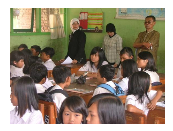
Kegiatan Open Lesson di SD N Rahayu 5