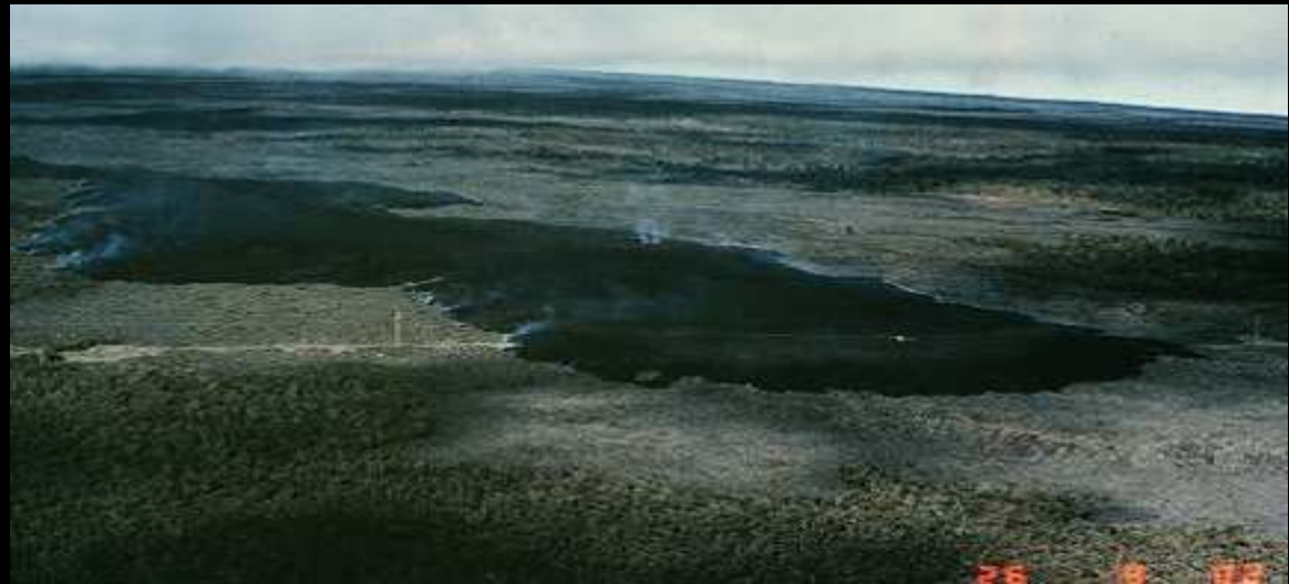
Fumarole Butte, Utah