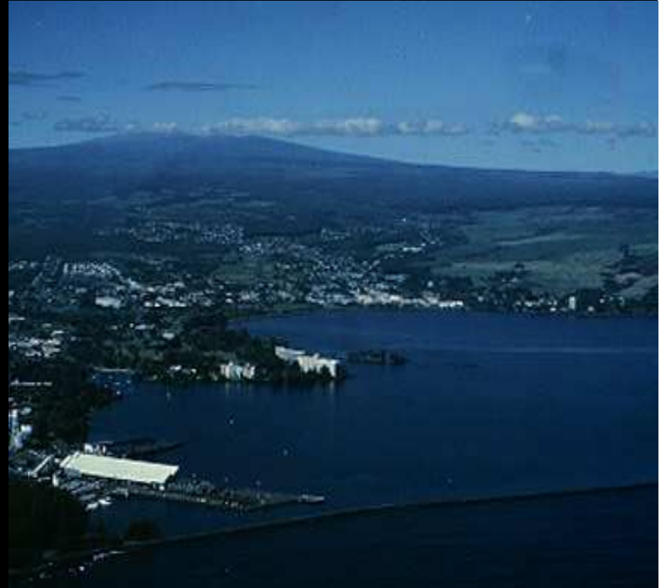
Mona Loa, Hawaii