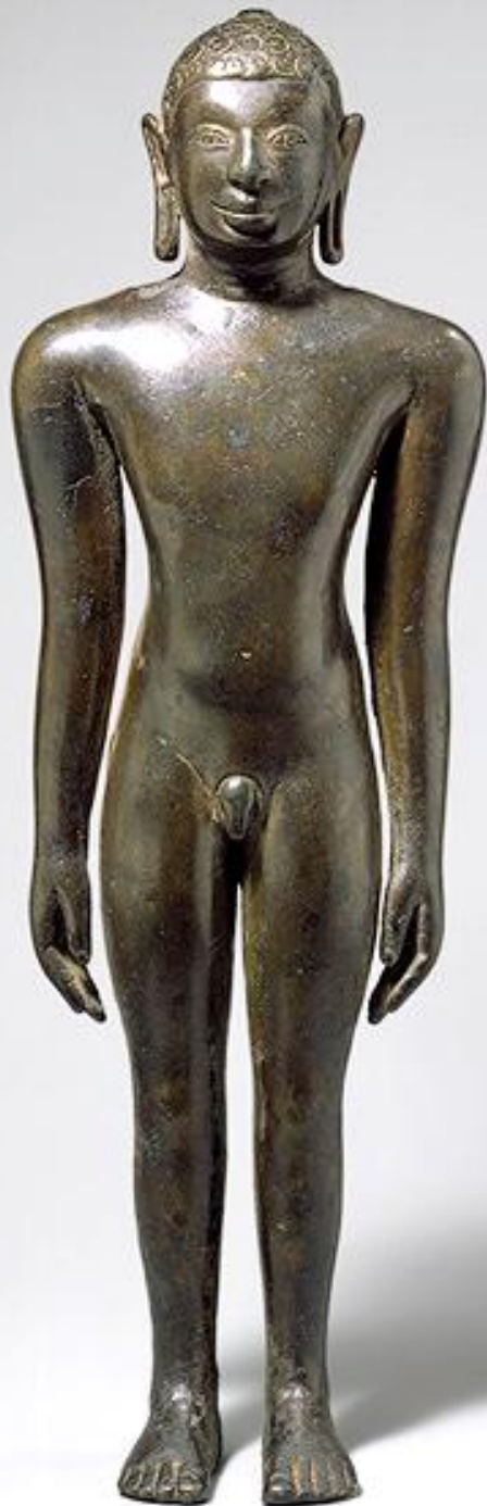
Standing Jain tirthankara , Chalukya period (ca. 475–800), 9th century Karnataka or Tamil Nadu, India Copper alloy; H. 13 1/8 in. (33.3 cm) Purchase, Lila Acheson Wallace Gift, 1995 (1995.423)