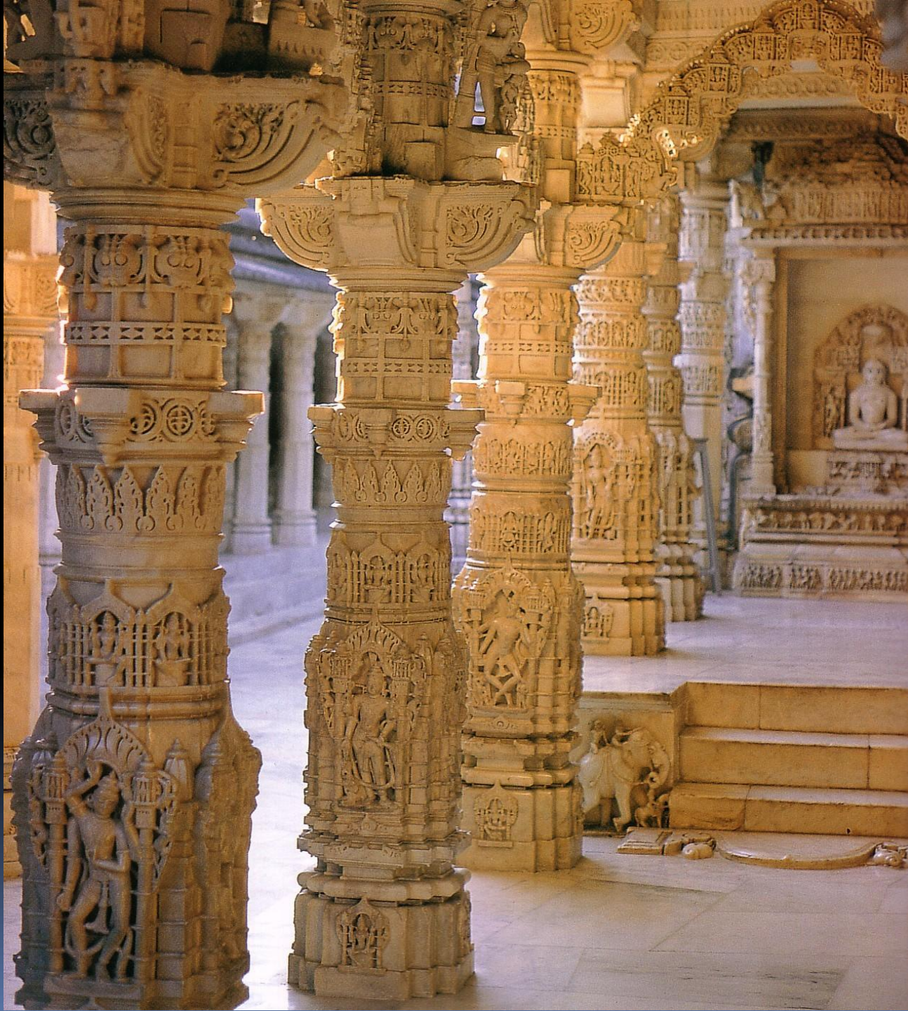
KUIL DILVARA, MOUNT ABU