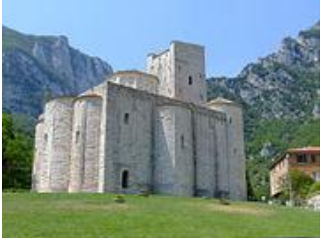
San Vittore alle Chiuse, Genga , Italy