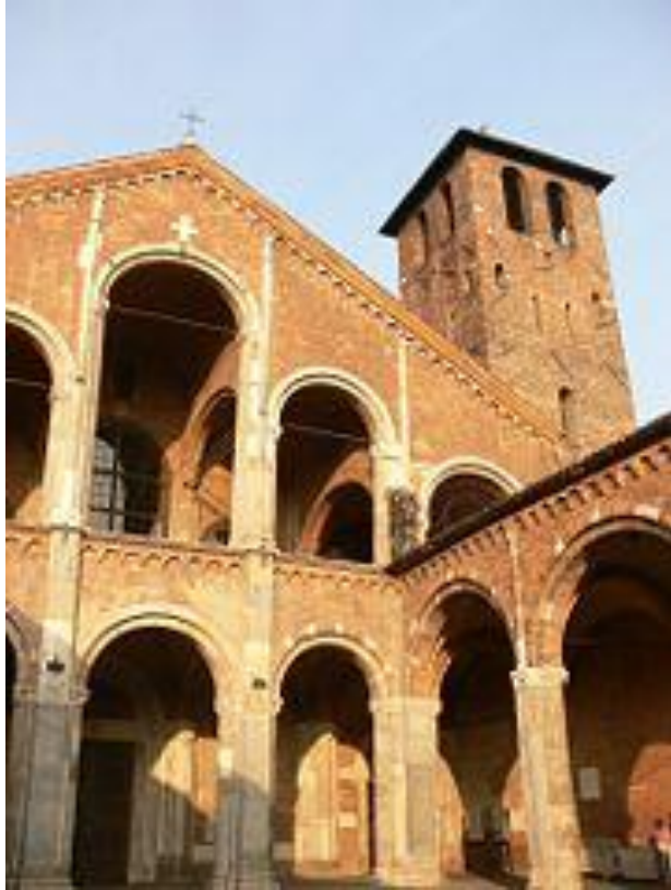
Sant'Ambrogio, Milan is constructed of bricks .